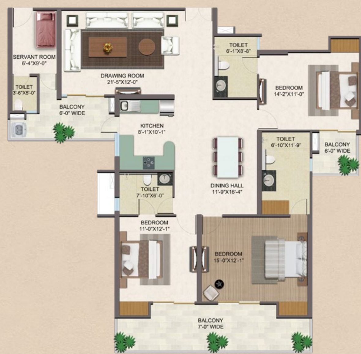
Saleable Area: 2402 Sq. ft.