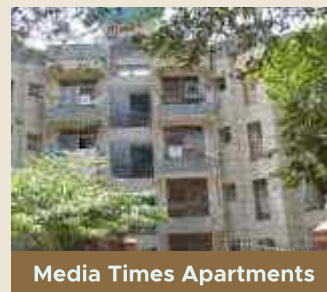
Media Times Apartments