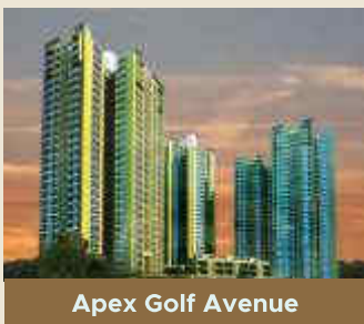
Apex Golf Avenue