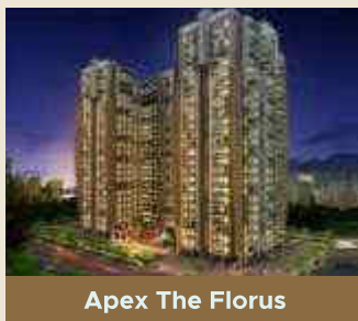
Apex The Florus