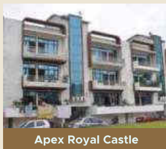
Apex Royal Castle